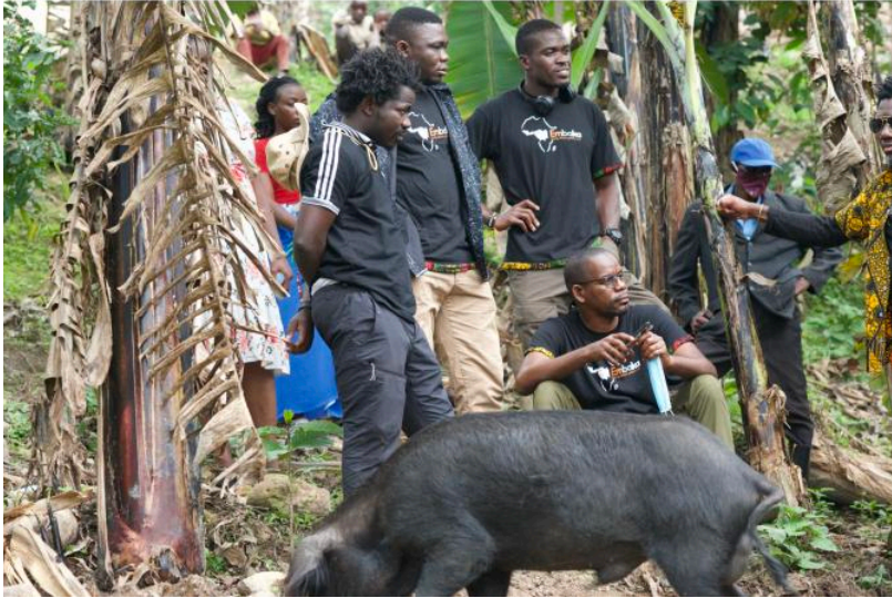
Photo 3 AGCCA partners visiting Embaka's community based "pig seed bank" projects and interacting with local communities.