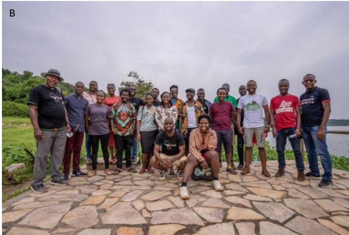
Photo 1 Participants of the inaugural meeting for the AGCCA on the first day at the CTC Conservation Center (A) and last day at Kazinga National Park (B).