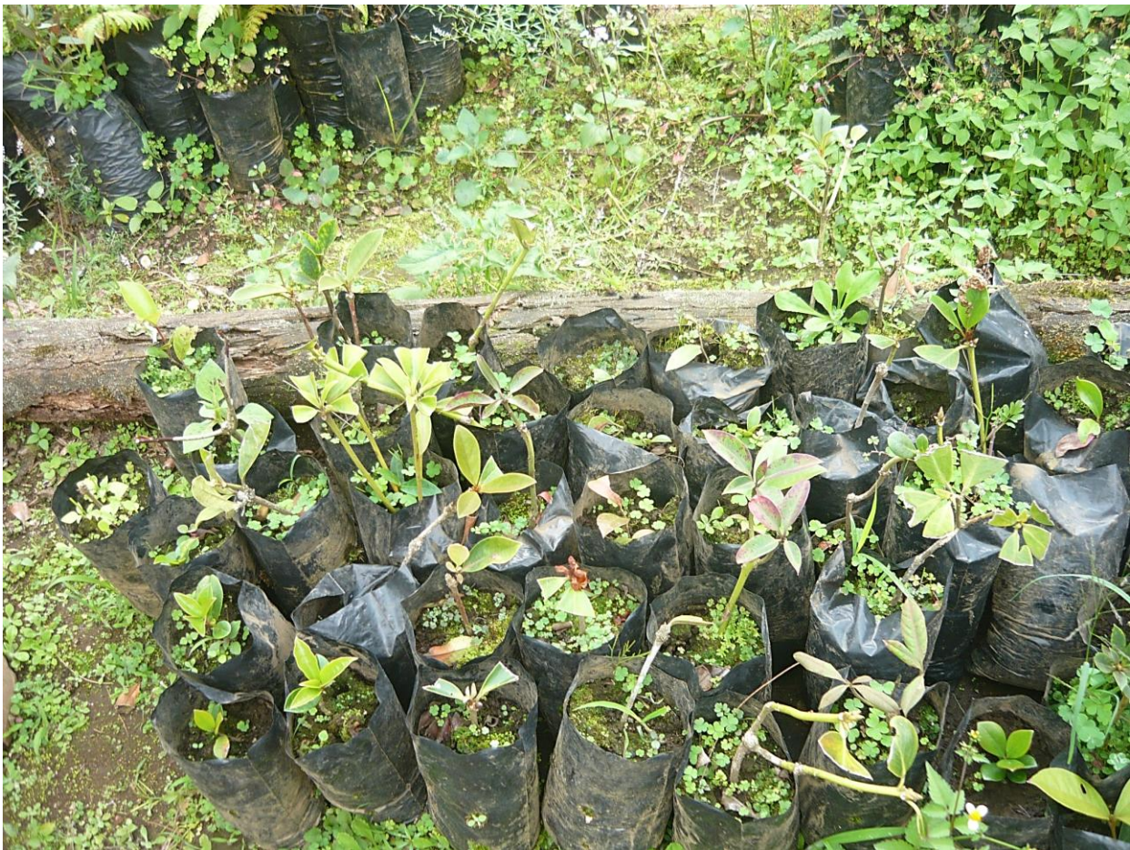
Young seedling of Rhododendron species propagated from cuttings in the small village nursery