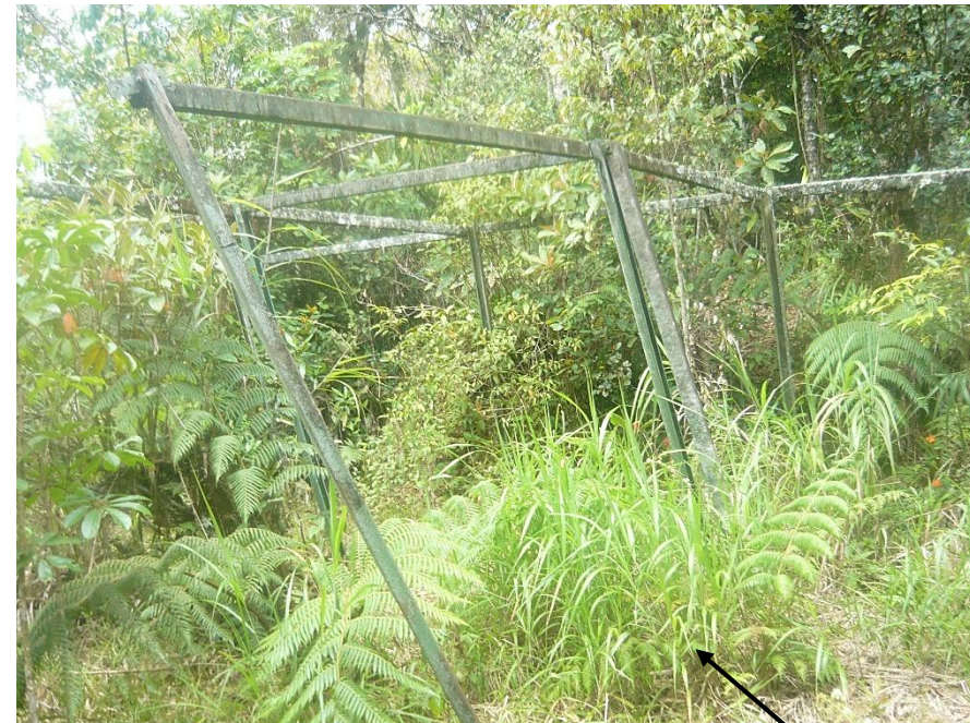
Where the nursery for Rhodos and Orchids used to be. Steel frame still there.