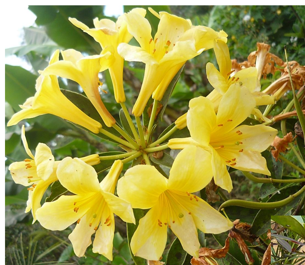
Close-up of the three Rhododendrons