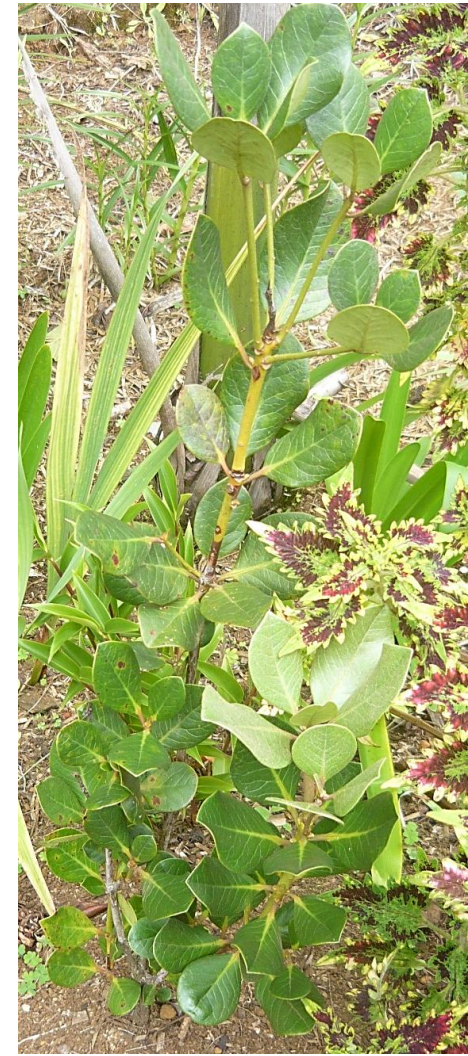
Young plants of Rhododendron species growing in the village (Nagamiya). The people from the village own that Mt Gahavisuka Park