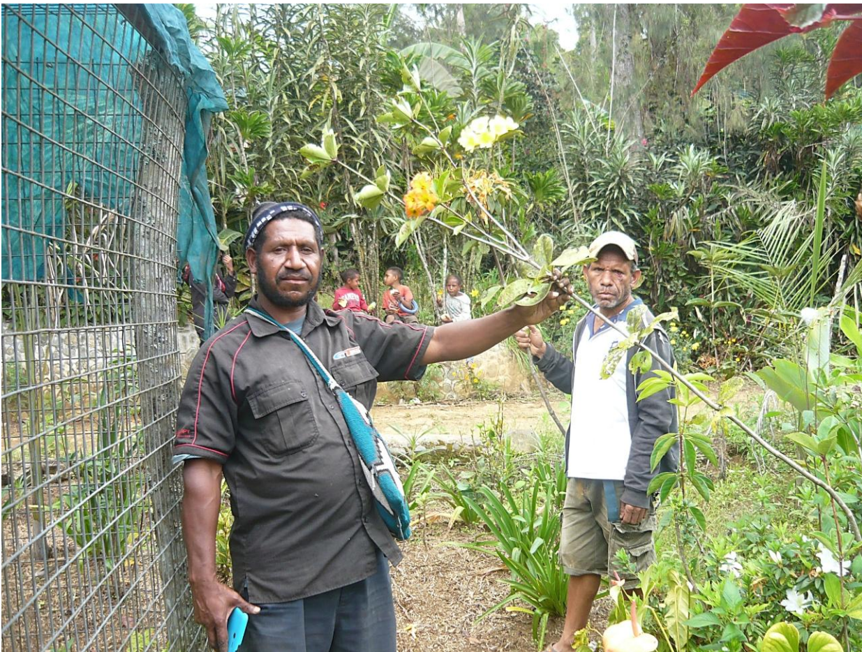
Son of the village leader holding a flowering Rhododendron species and standing next to a small nursery purposely made to propagate Rhododendrons. The village people called the rhodos "Lokeha" their their Gahuku language