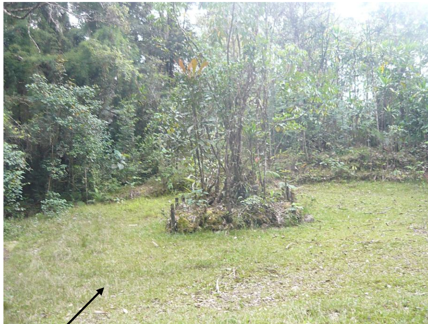
Road end circle/car park in the Park