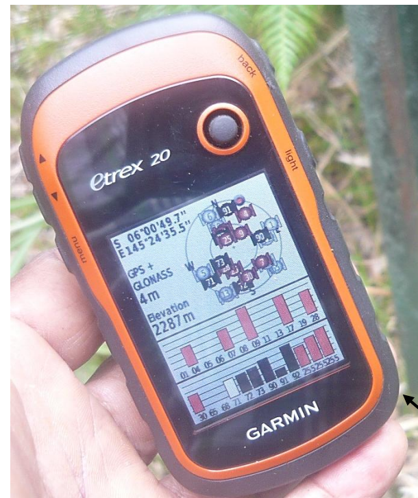
GPS reading. Altitude: 2287m