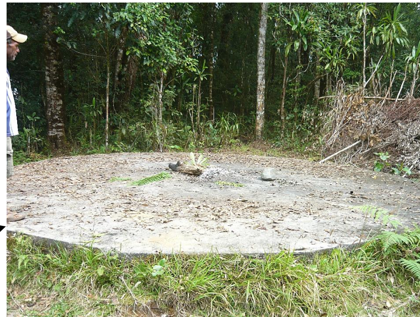
Concrete left-over when it used to be a shed used as Information Centre