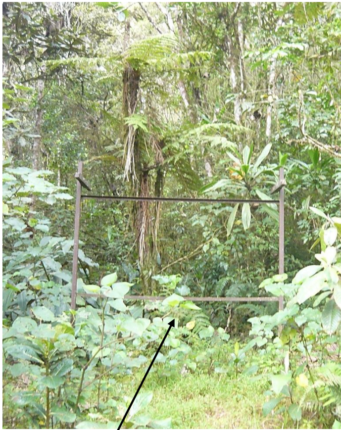
Mt Gahavisuka Park. Steel frame where signboard used to be