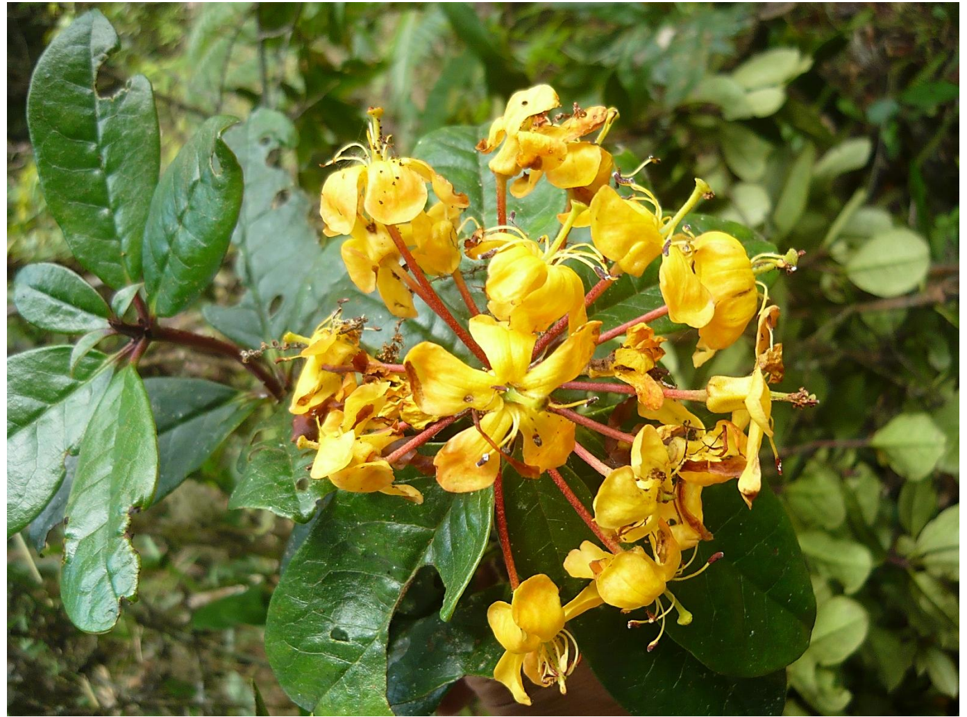
Rhododendron species growing within the Mt Gahavisuka Park