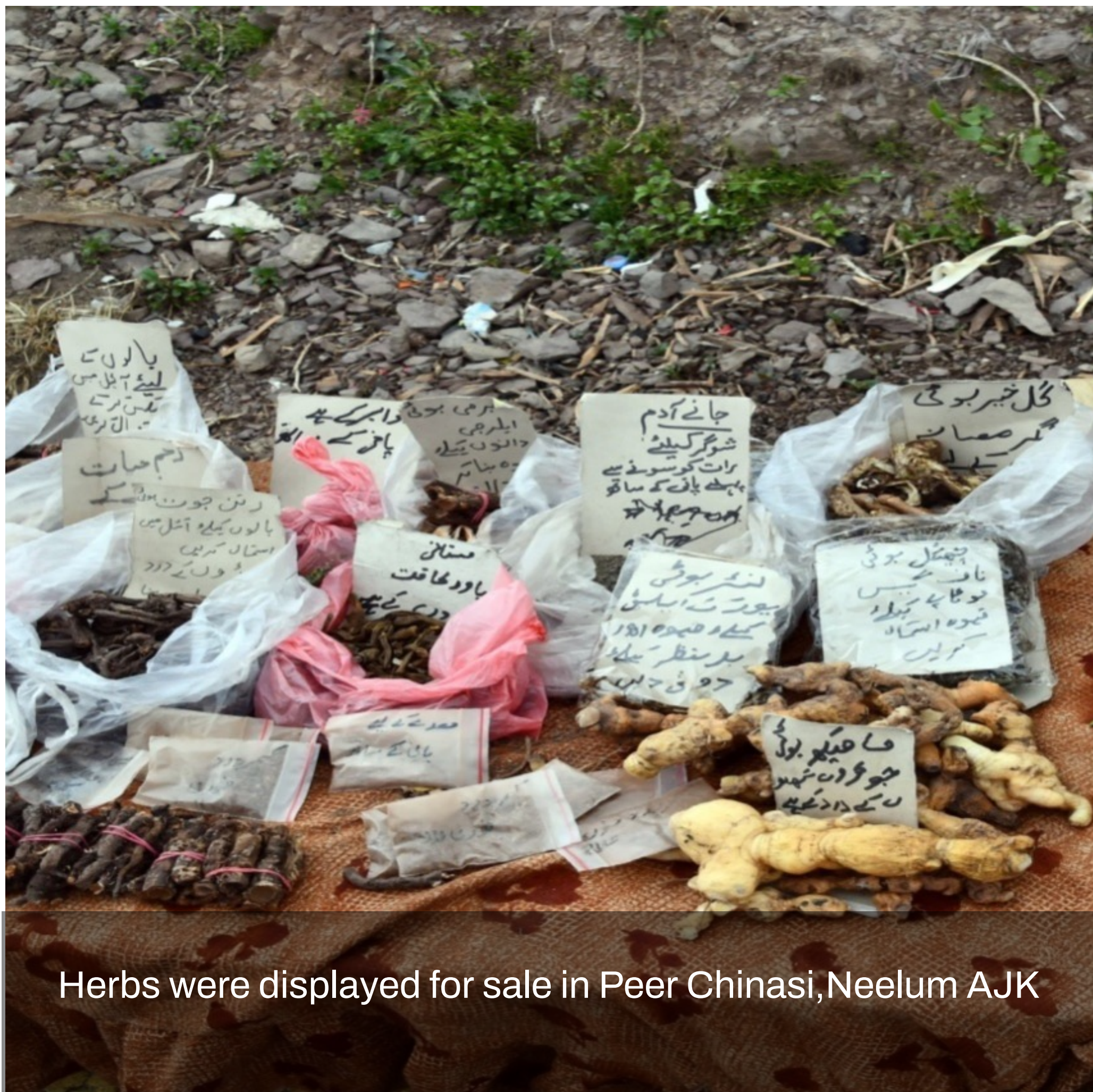
Herbs were displayed for sale in Peer Chinasi, Neelum AJK