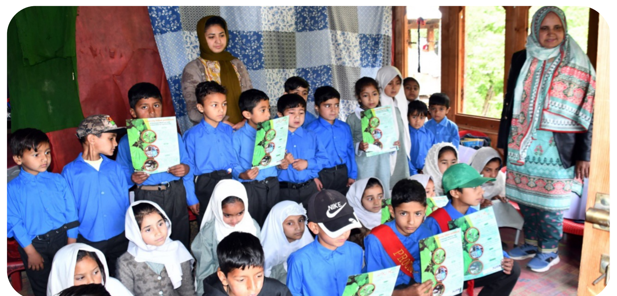
Awareness session with junior students in Leepa.