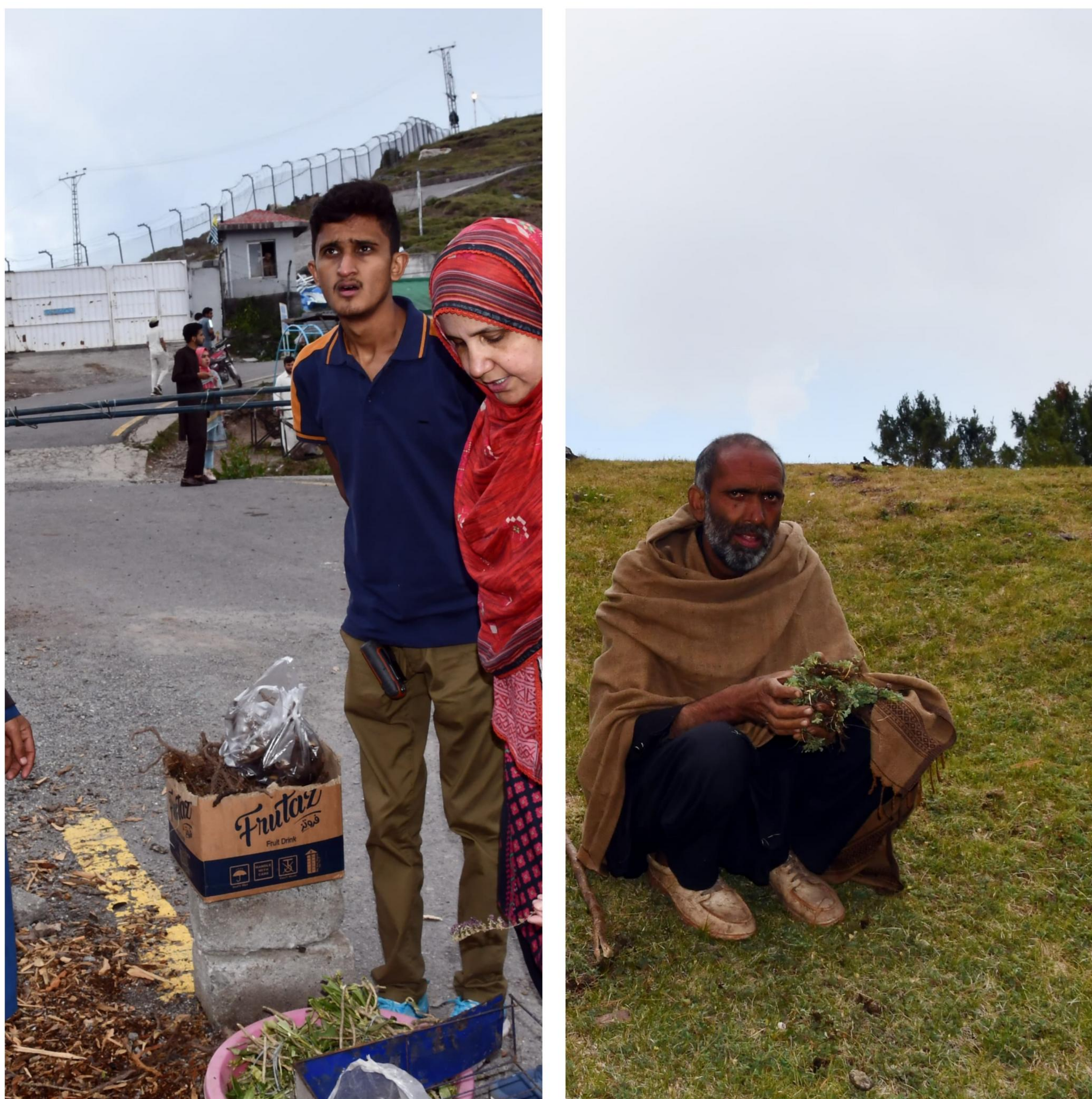
Fig 5 Herb Collectors and Sellers: Information on Endangered Species

Locals were asked a questionnaire about last sight seeing (Fig 5). The data is in process.