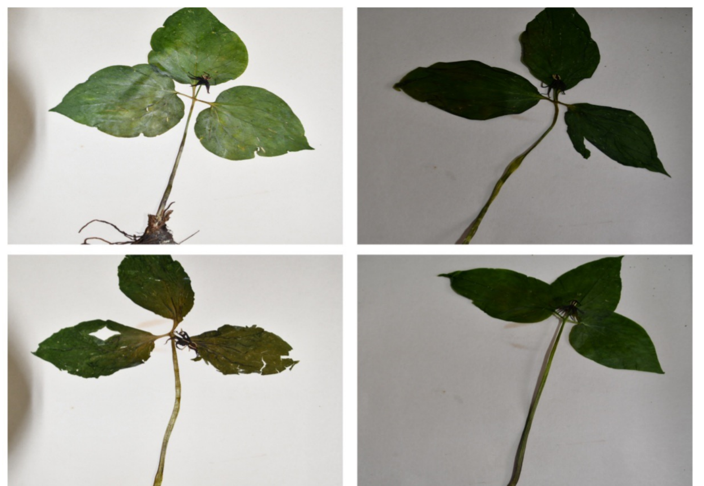
Fig. 3 : Representative specimens of endangered herb Trillium govonianum from top left location, Arang Kel, Janawai,

Representative samples were collected, dried, pressed and fumigated and still in process for proper accession numbers (Fig 3)