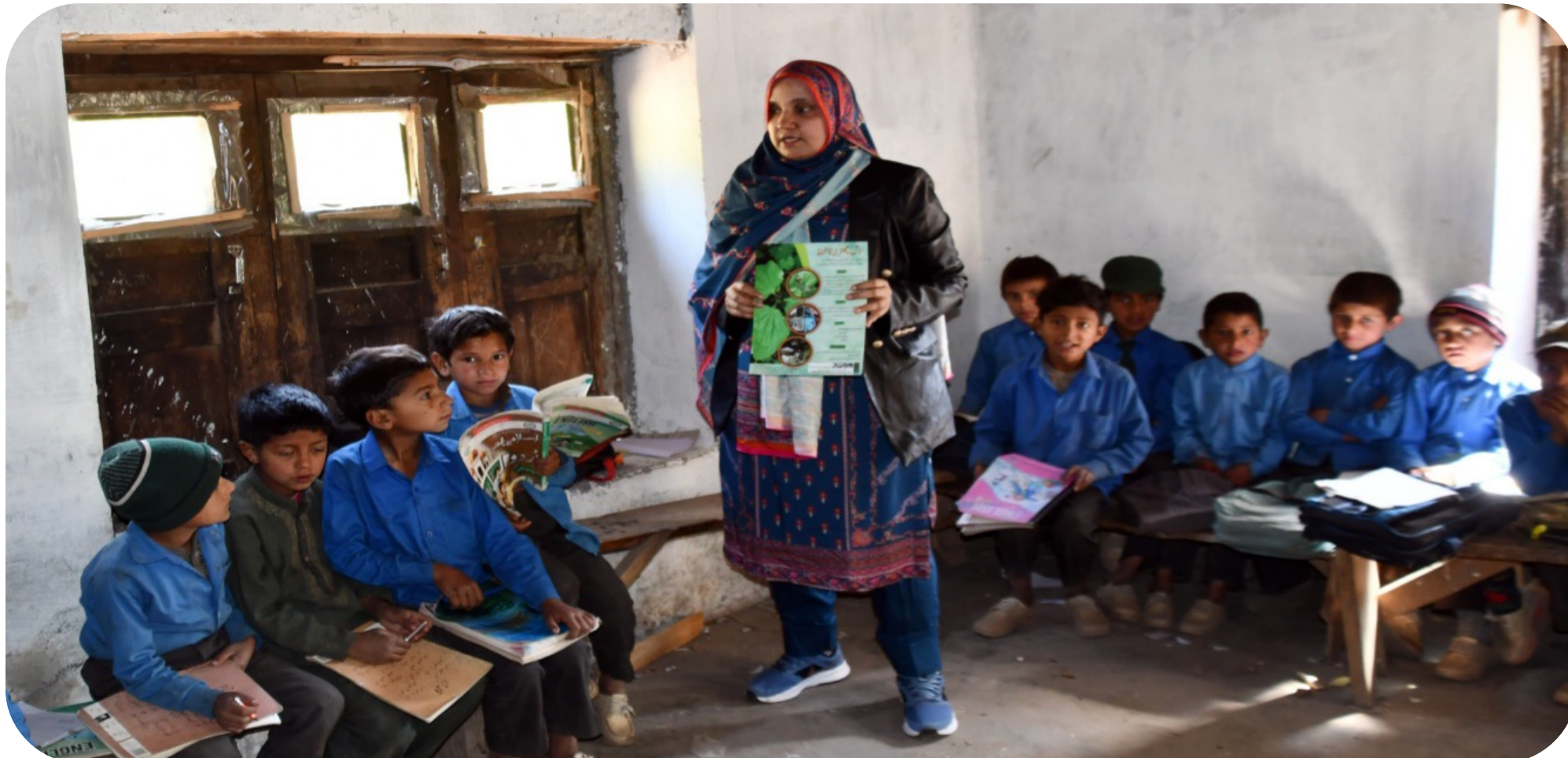
Awareness session with junior students in Janowai - Neelum.

The session concluded with a quiz to reinforce the knowledge gained, providing a fun and engaging way for students to review what they learned