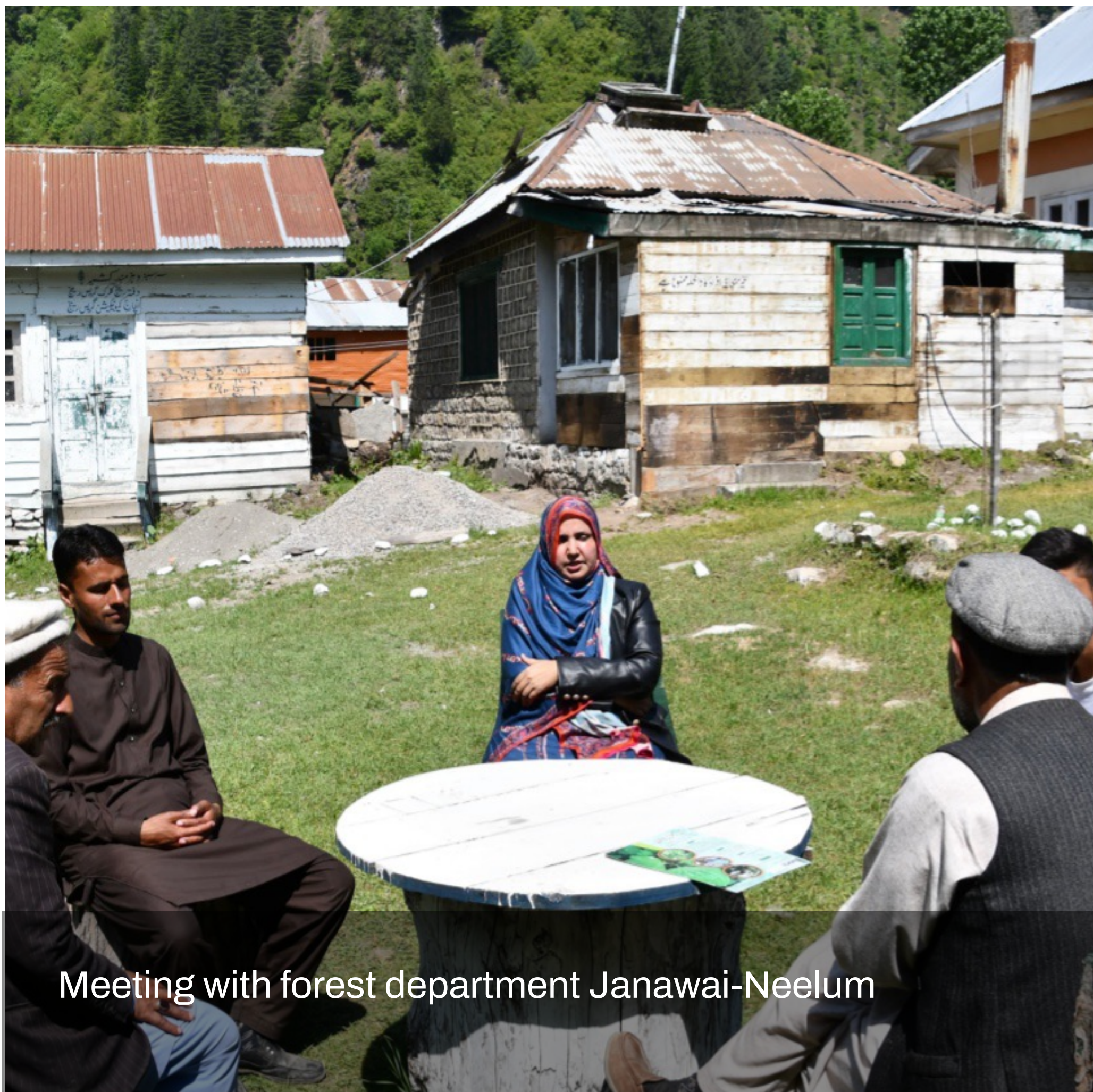
Meeting with forest department Janawai-Neelum