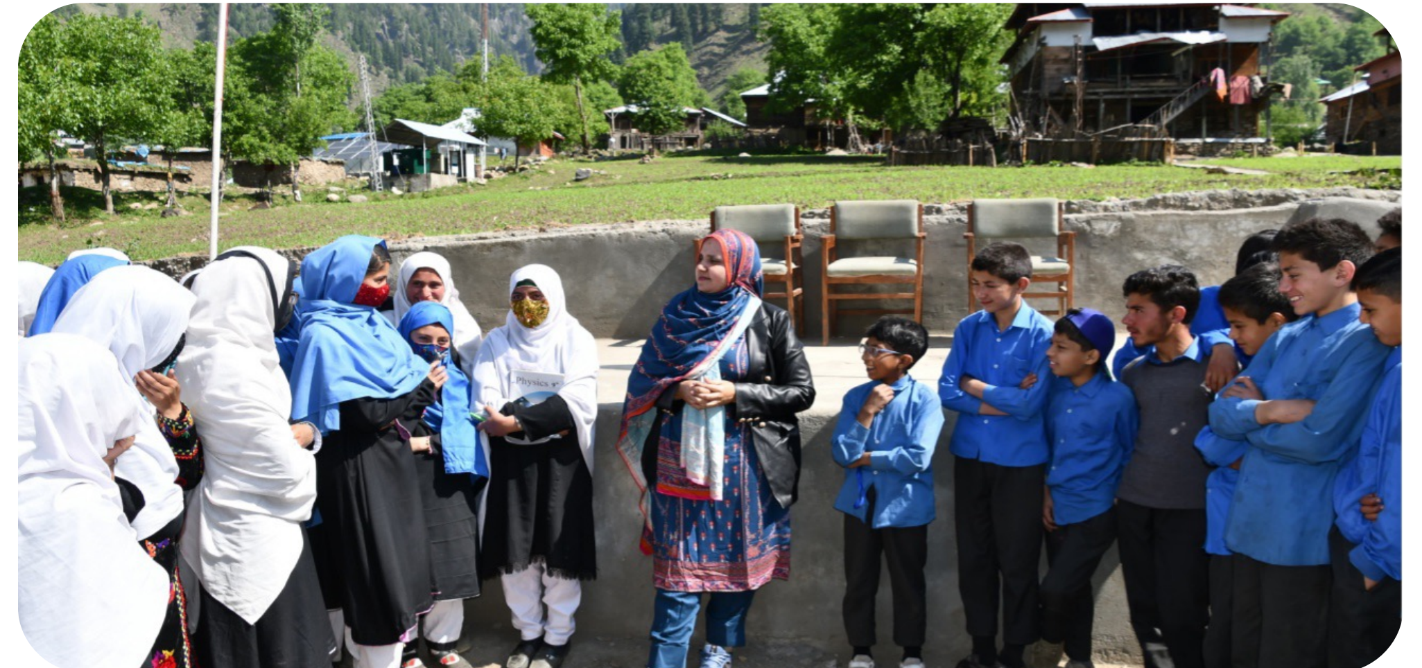
Awareness session with senior students in Janowai - Neelum.