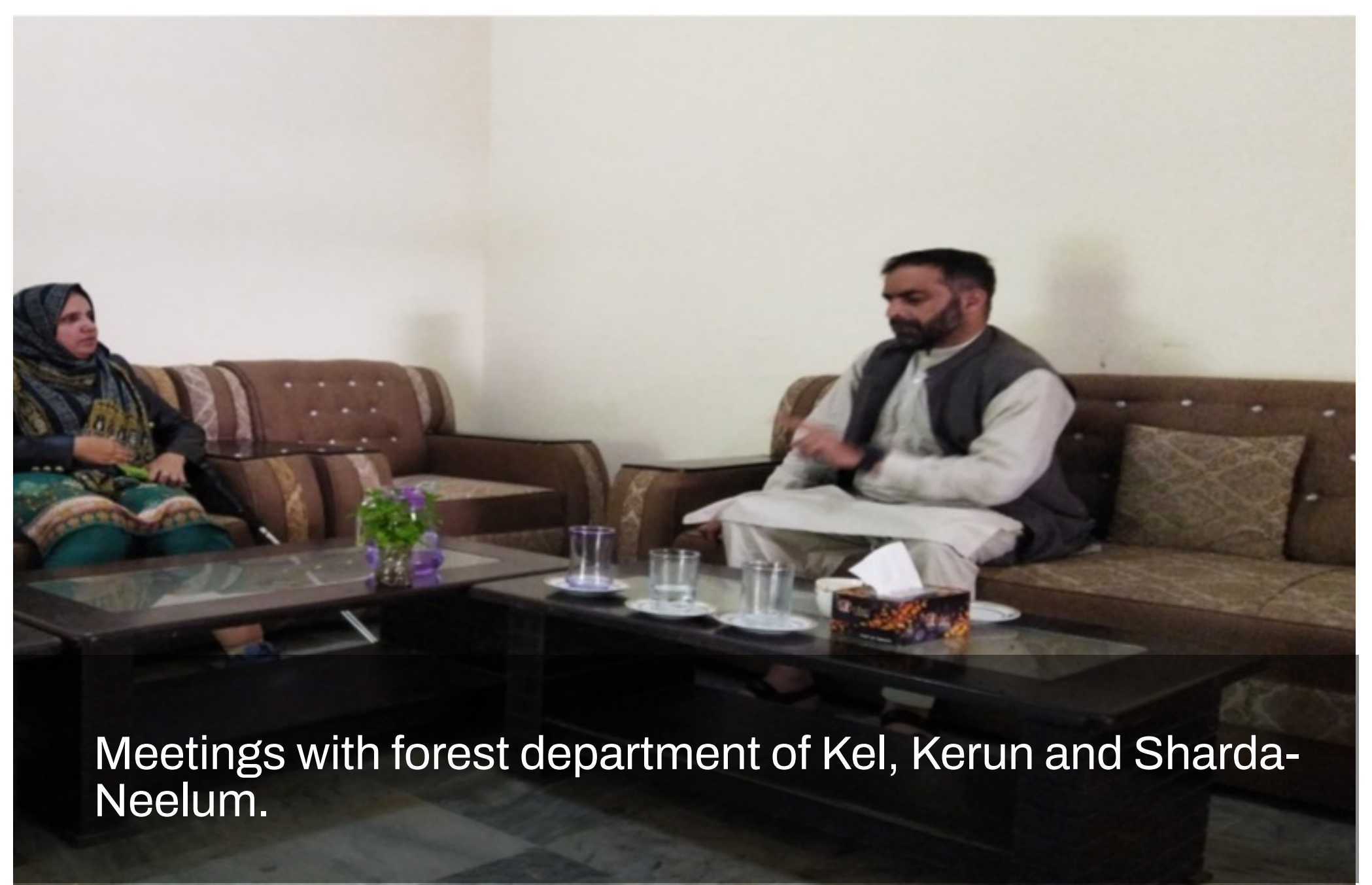
Meetings with forest department of Kel, Kerun and Sharda-Neelum.