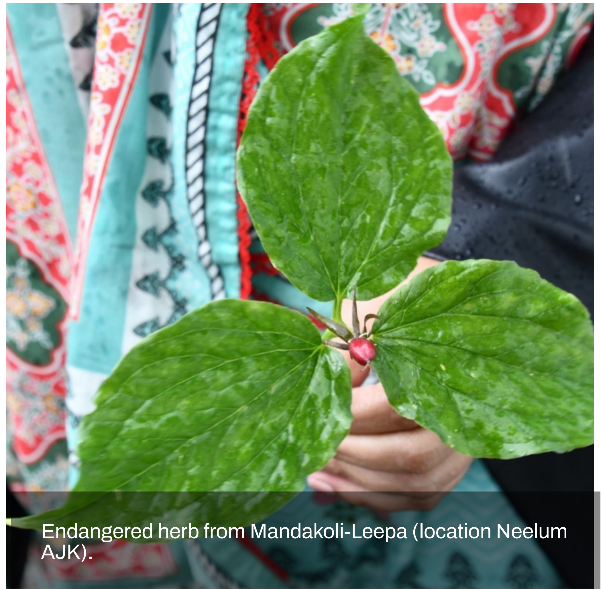
Endangered herb from Mandakoli-Leepa (location Neelum AJK).