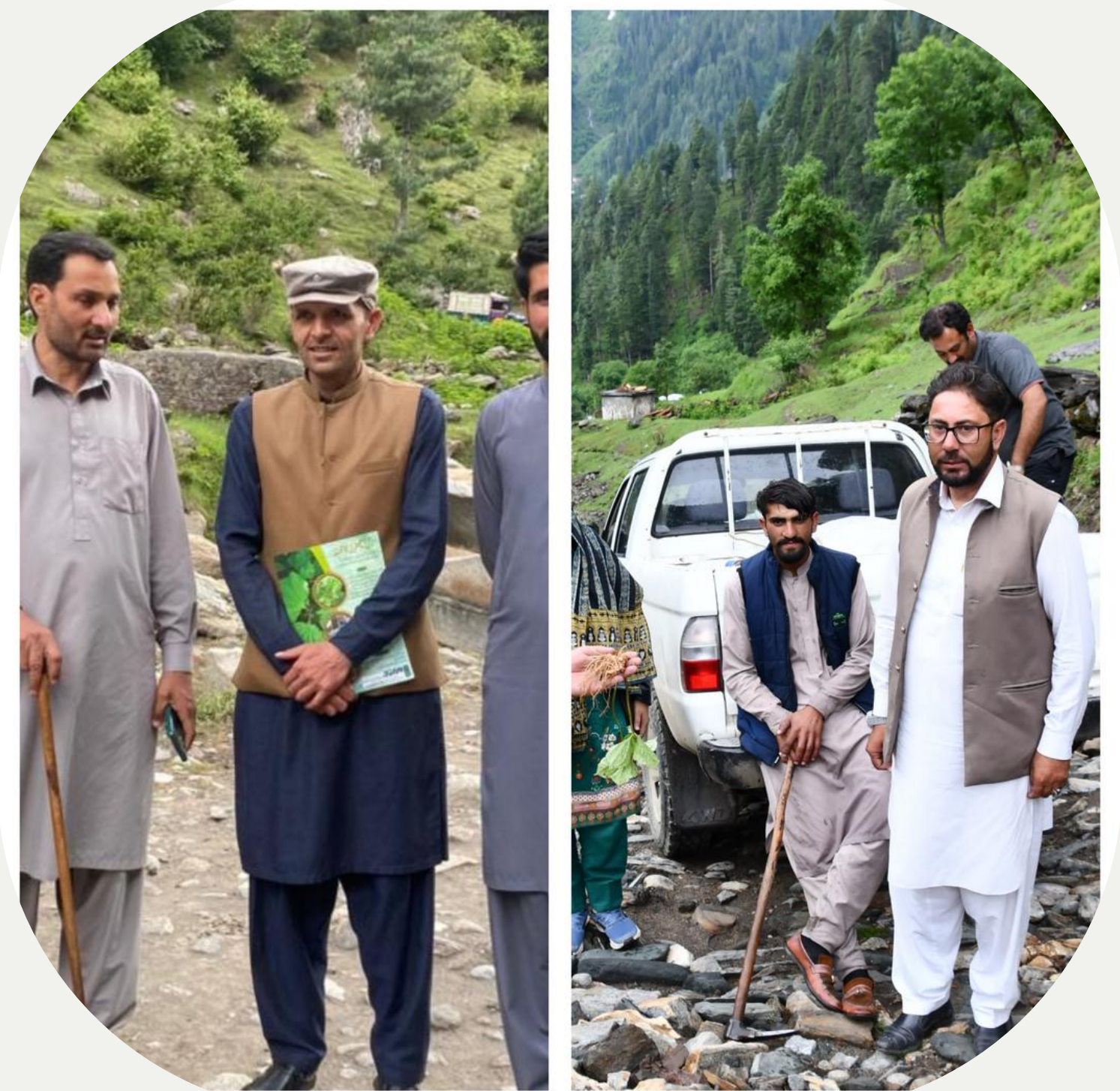
Fig 7 : Session wiith locals

Most of valleys has concept that they own all natural resources and can use it or sale it like in Pulwai, Sharda (Fig 7)