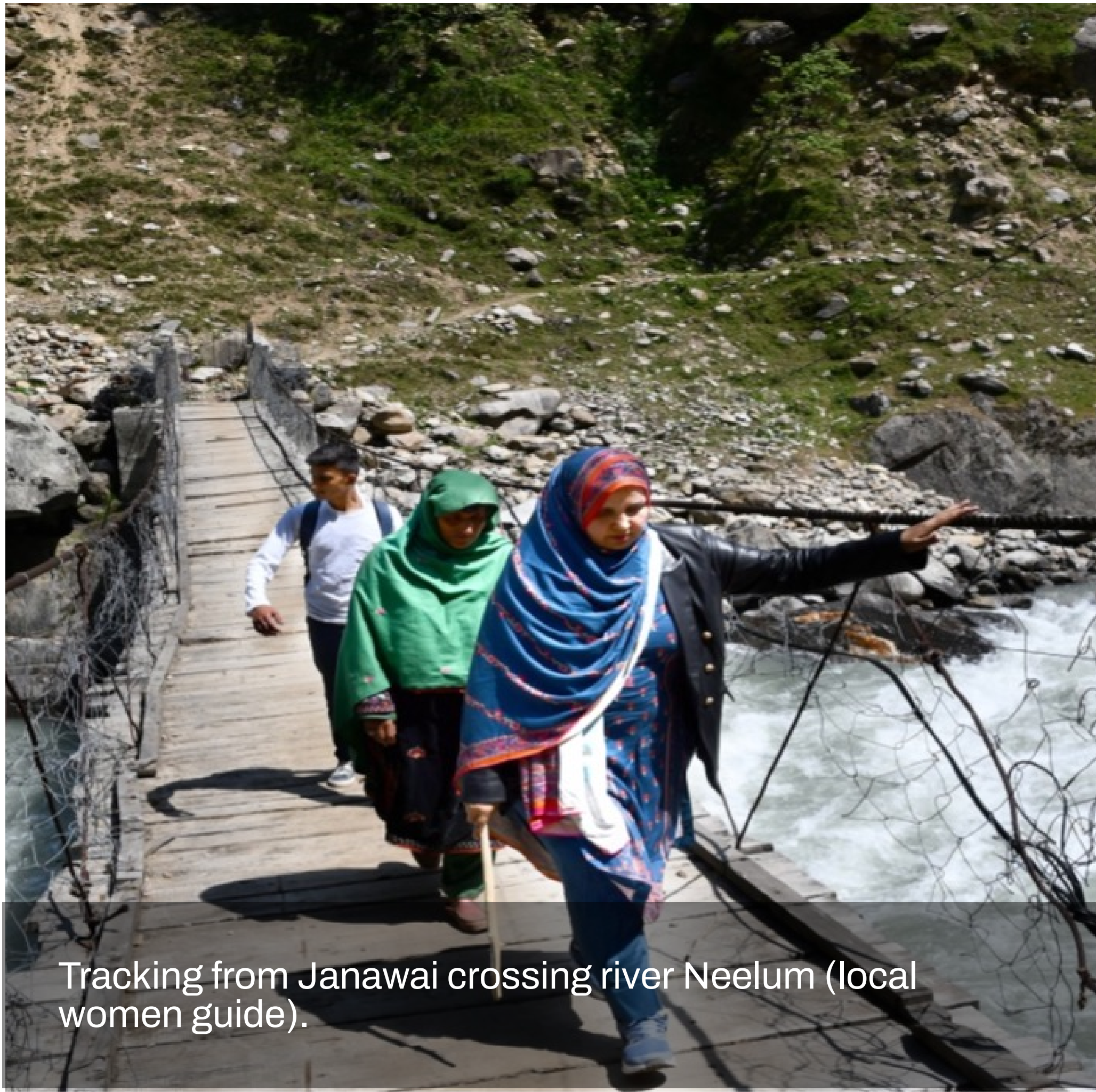
Tracking from Janawai crossing river Neelum (local women guide).