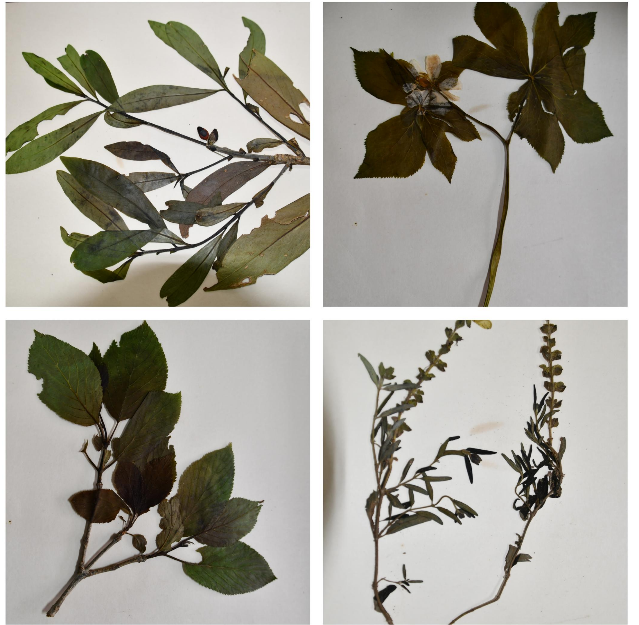
Fig 4: Herbal specimens from top left to right

The specimens are in process of herbarium pressing, drying and cataloguing.