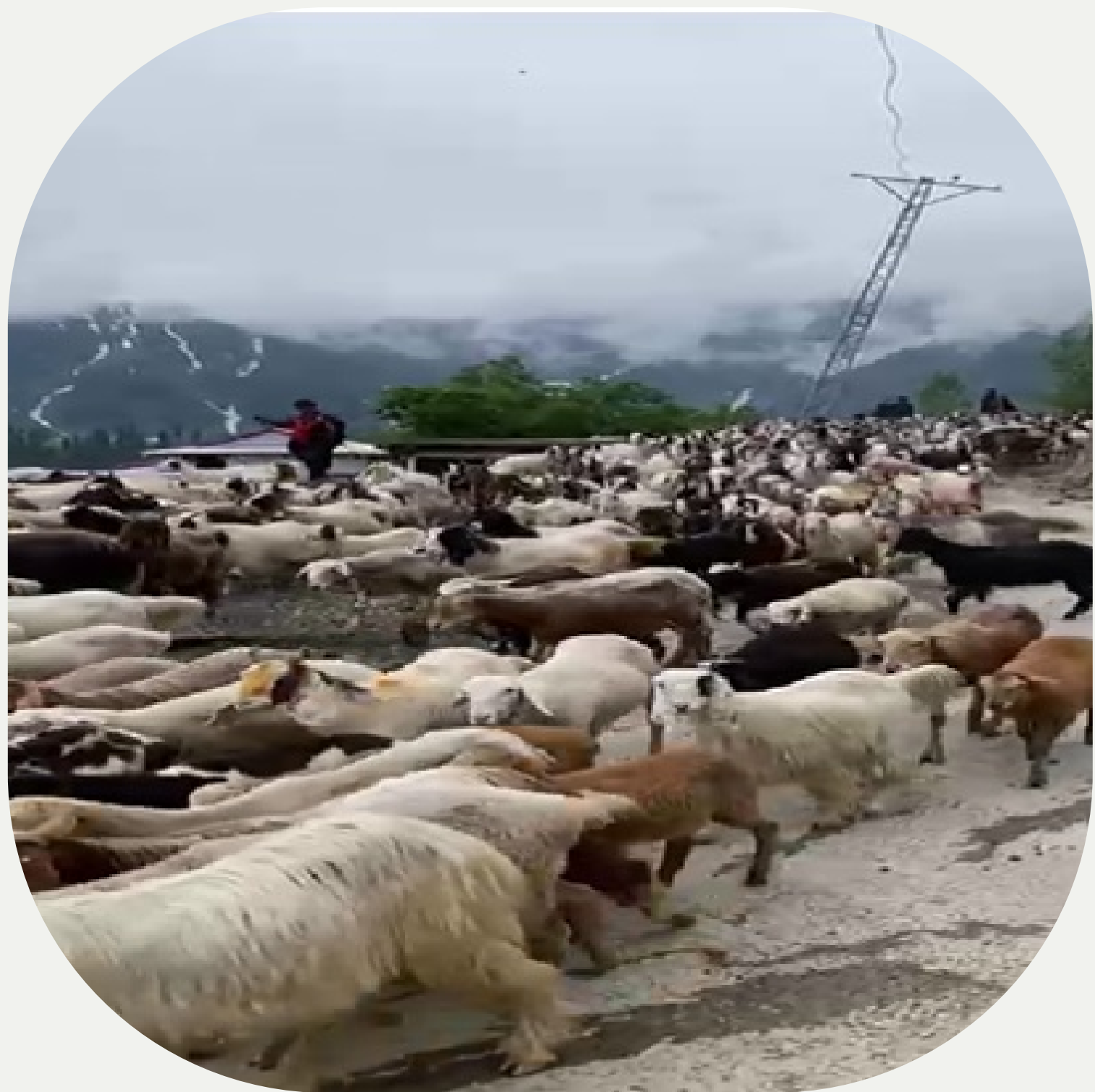
Fig 6: shepherd movement in Neelum

Local seasonal shepherd movement and stormy rain and land sliding (Fig 6).