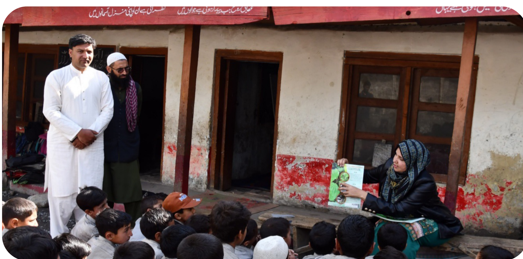
Awareness session with junior students in Sharda - Neelum.