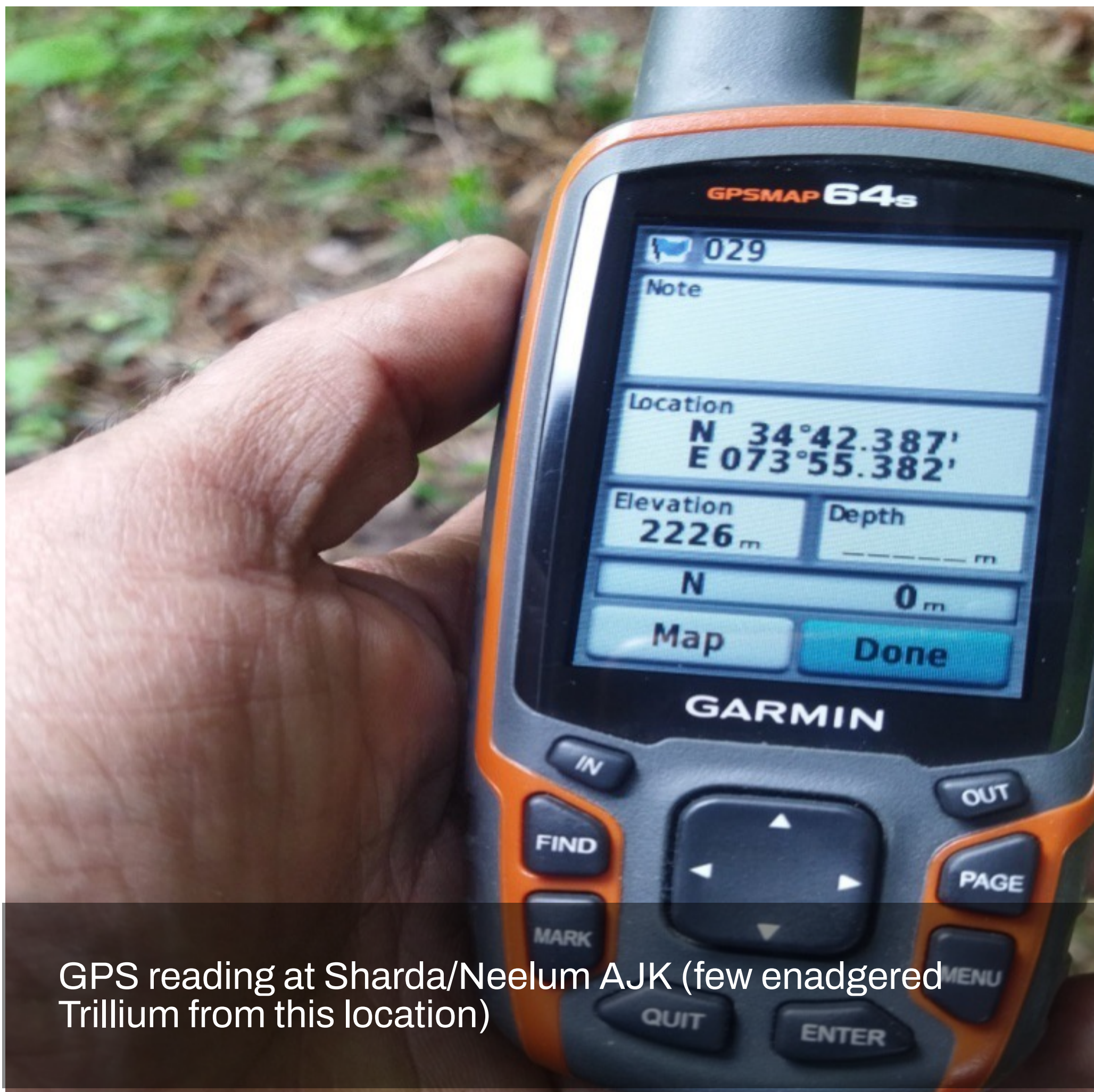
GPS reading at Sharda/Neelum AJK (few enadgered Trillium from this location)