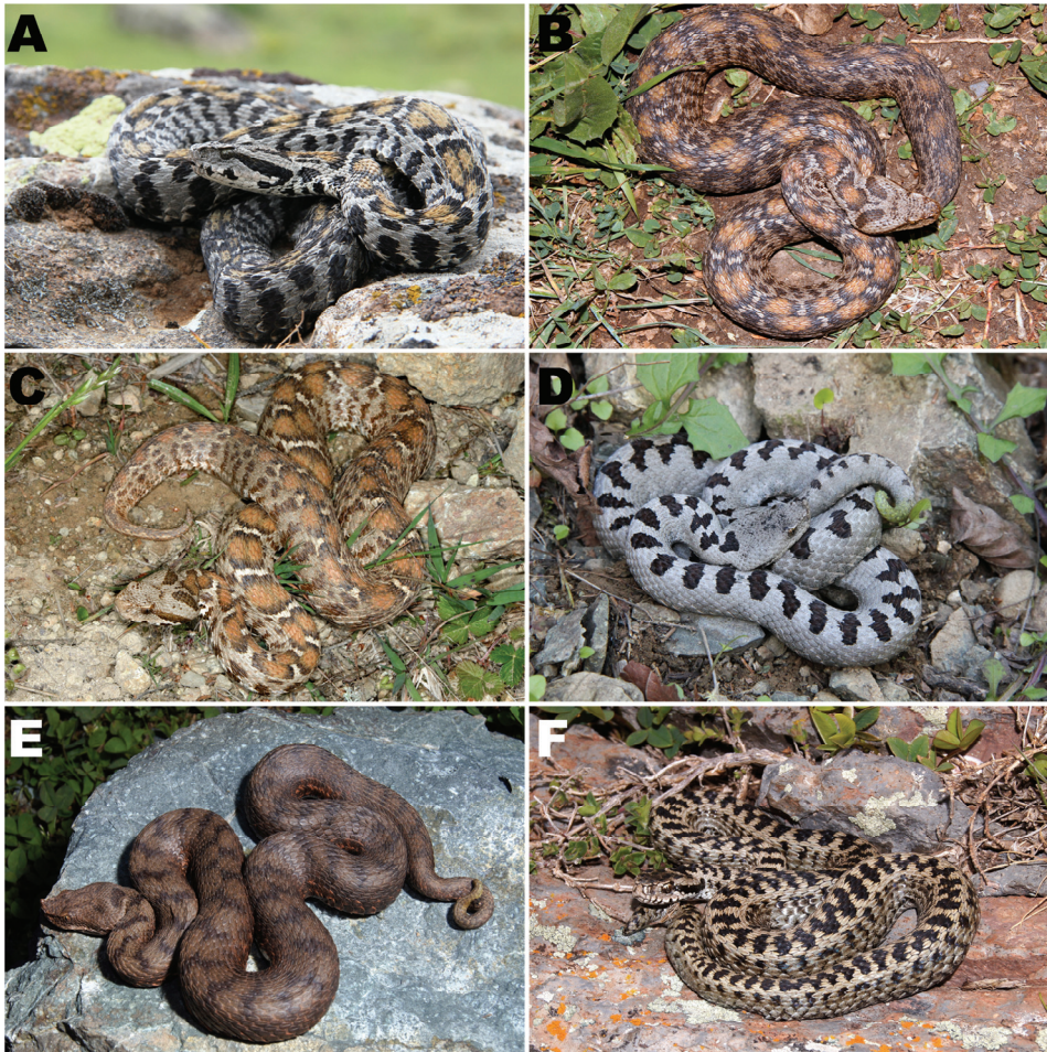
Figure 1. Vipers in their natural environment. A: Montivipera wagneri from Malazgirt, Muş, B: M. wagneri from Camuşlu, Kars, C: M. albizona from Kemaliye, Erzincan, D: Vipera ammodytes transcaucasiana from Kızılcahamam, Ankara, E: V. ammodytes transcaucasiana from Meydancık, Artvin, F: V. darevskii from Sulakçayır, Ardahan.